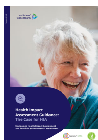
The Case for HIA