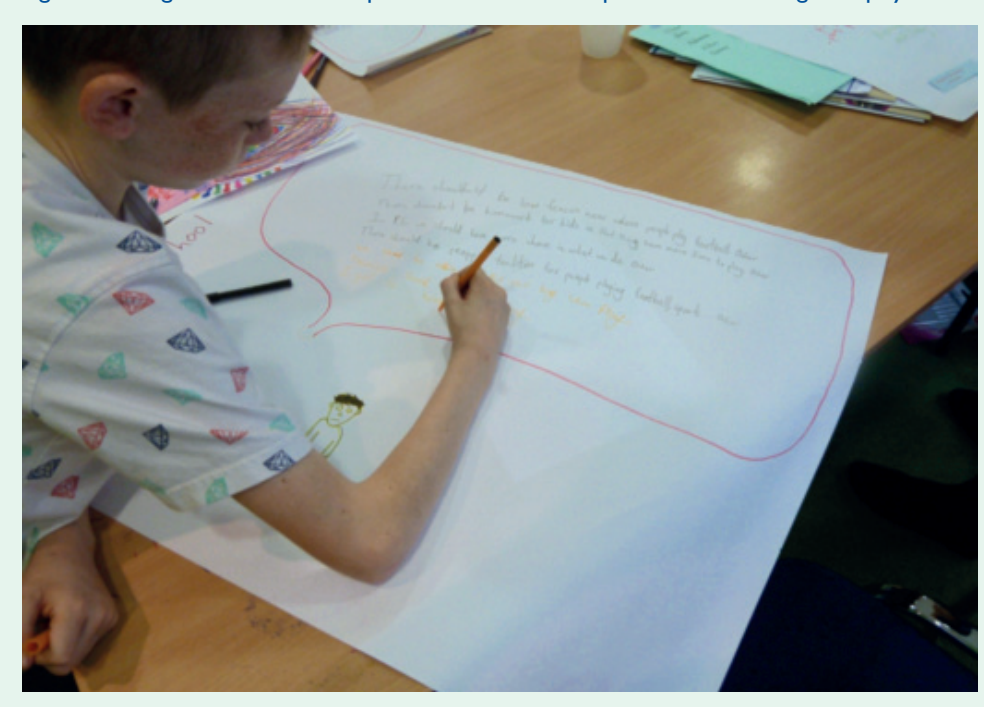
Figure 1: Young Researchers example of a school that respected children's right to play

contexts. Play in the home or community represents play outside of the formal school day, therefore this play context is reported as play in the community setting. Overall, the data indicate that children are positive about their right to play, in that the majority of children either 'agree' or 'strongly agree' with all of the statements. However, given that Article 31 is a right and state parties are obligated to guarantee that this right is respected, protected and fulfilled, the level of disagreement and strong disagreement with the statements is striking and requires exploration.